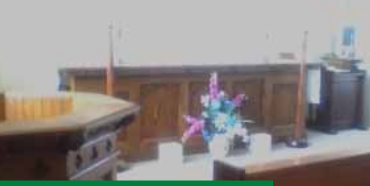
EQubed REVIVE Furniture recycling enterprise engaging young people