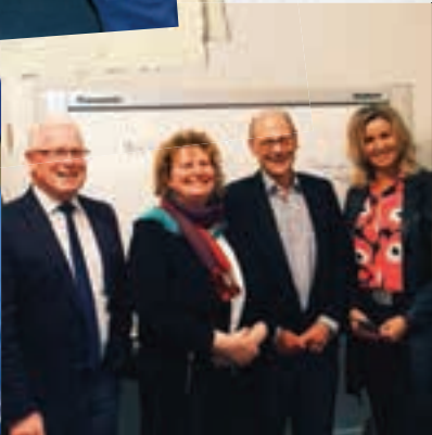
YELLOW DOOR FOUNDATION