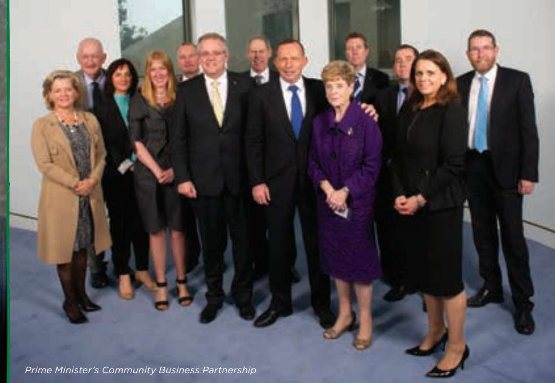
Prime Minister's Community Business Partnership