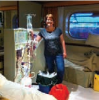
DIALYSIS ESCAPE LINE AUSTRALIA

“Bedford Phoenix has been able to engage Exercise Physiologists to develop individualised tailored ‘Bootcamp’ programs for people with a disability. For many of the participants, this has been their first exposure to organised, structured exercise that focuses on improving mobility and flexibility.”