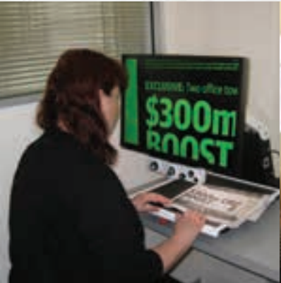
ROYAL SOCIETY FOR THE BLIND SA