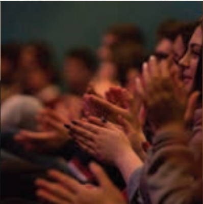
CONCERN AUSTRALIA MINISTRY