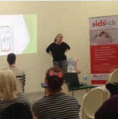
SIDS AND KIDS SA