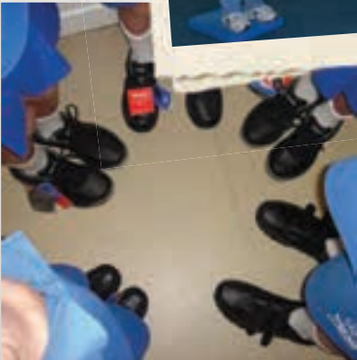
BRIGHTER FUTURE 4 KIDS FOUNDATION