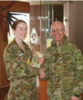
BIBLE SOCIETY AUSTRALIA