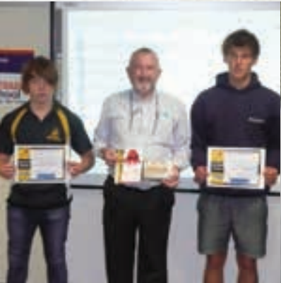
ASBESTOS DISEASES SOCIETY OF AUST